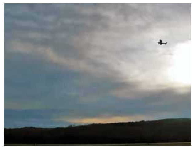
The Cessna 152 (owned by Sterling Airways) over Hornell Airport. My son Santi is flying with my husband, Pat.