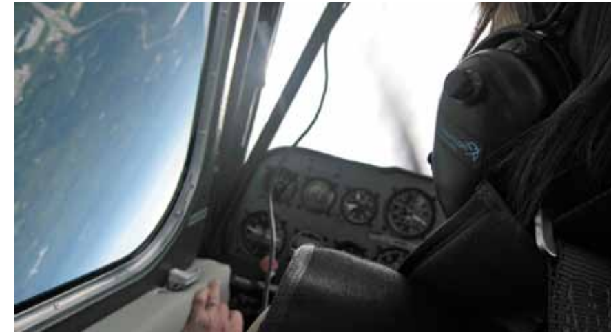
Aerobatic lesson (Executive Flyers Super Decathlon).

The day of the competition arrived. As I drove down to Lumberton, New Jersey, to meet the decathlon, I had time to reflect on my good fortune. Two years earlier I had never been in a