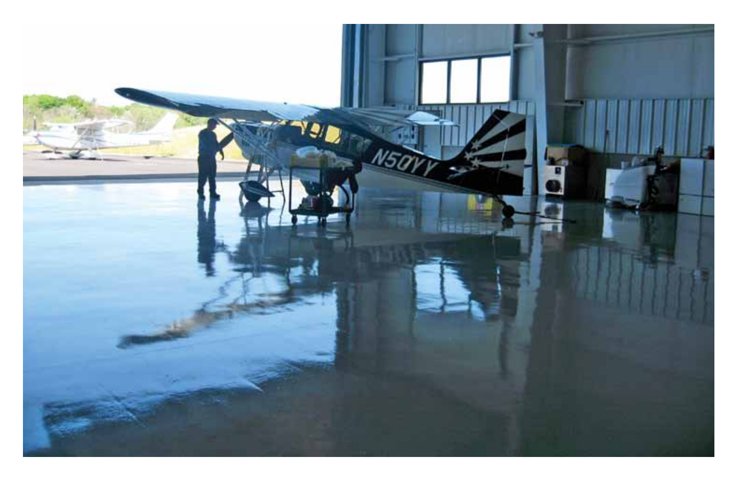
The Super Decathlon receives a waxing between my lessons in the Lawrence, MA hangar (Executive Flyers Aviation).

Visions of abundant hours in sparkling new airplanes, accelerated skill development, and expert instruction dance in my head. The seemingly endless days of waiting allow me to cultivate and relish my dreams. And then, once the decision is made, the brutal reality of just where I stand hits home.